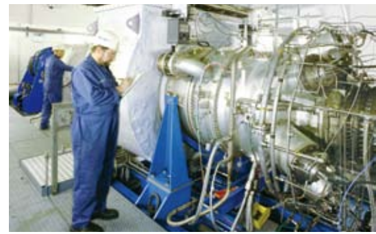
SGT-400 core engine test facility.